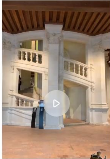
The double helix staircase

The Chambord staircase, which has two spirals so that two people can use the staircase at the same time without running into one another