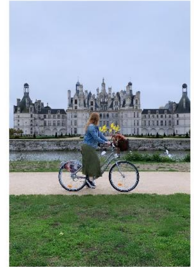
The Château of Chambord

A unique architectural jewel built starting in 1519 at the request of Francois I, a lover of the arts and passionate hunter.