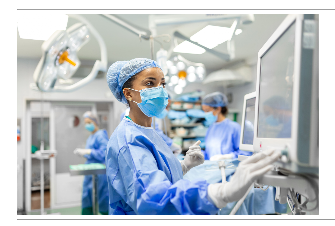
Unwavering state-funded support

France is also recognised the world over for the quality of its research centres, such as the Institut Pasteur, a key player in biomedical research on an international scale. Lastly, the country's health bioclusters, such as Paris-Saclay and Lyon Biopôle, enhance France's visibility internationally, attracting investors and talents within a competitive and innovative ecosystem. Bringing together companies, laboratories and institutions to fast-forward biomedical innovation, they play a key role facilitating collaborative research, the development of new therapies, and the industrialisation of cutting-edge technologies.