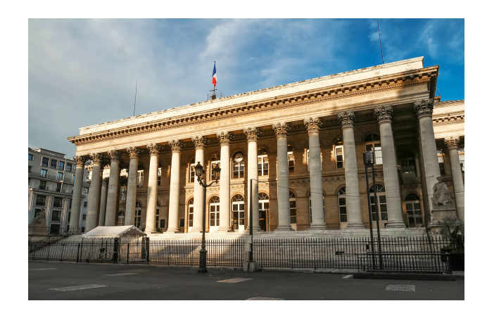
A dynamic financial sector feeding an attractive economy

Finance and fintech occupy a central role in the French economy. Paris is at the forefront of this, providing the setting for renowned institutions such as BNP Paribas, Société Générale and AXA, as well as other leading international players in the sector. Thanks to <a href="Euronext">Euronext</a>, one of Europe's main trading platforms, the capital enjoys privileged access to global markets and has recently overtaken London to become the main stock market in Europe in terms of market capitalisation.