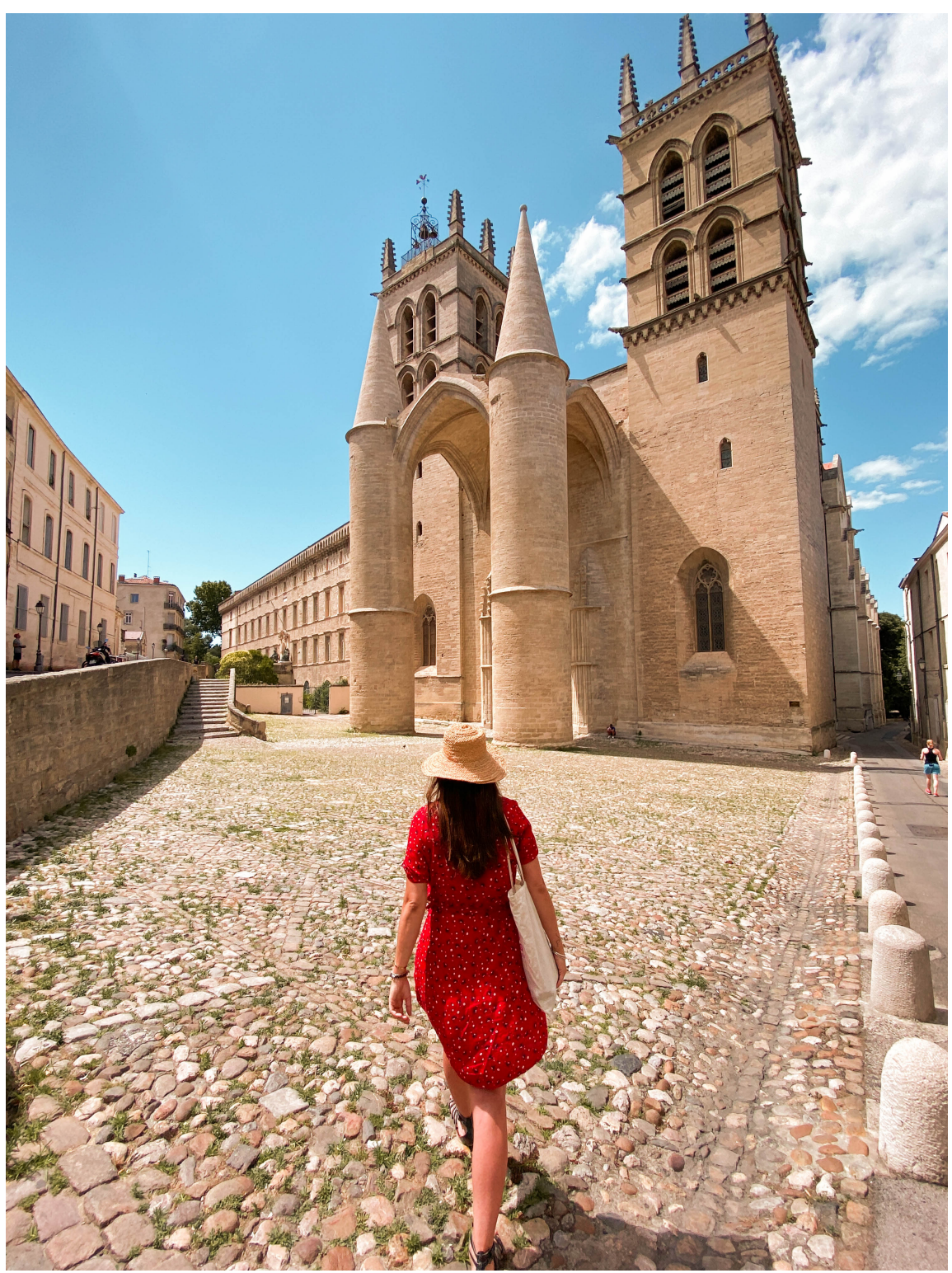
Montpellier is a city of contrasts , blending historical heritage with contemporary creativity. The medieval streets of the Écusson quarter coexist with bold architectural projects by renowned designers such as Jean Nouvel and Zaha Hadid . Art lovers will appreciate MO.CO. and the Fabre Museum , while music and theater enthusiasts can enjoy an extensive cultural program year-round. A city that never ceases to reinvent itself while preserving its soul.

(Re)Discover Montpellier Méditerranée Métropole